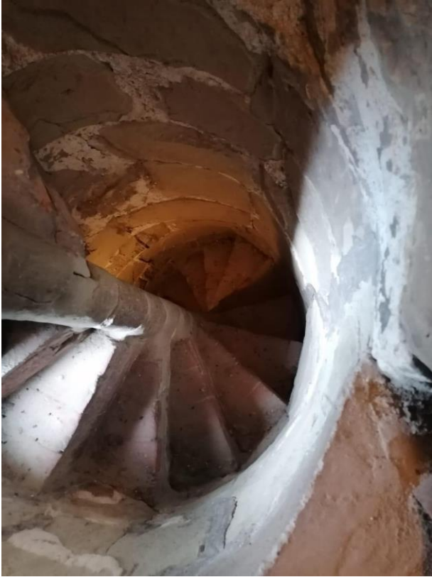
The steep spiral staircase leading to the clock.